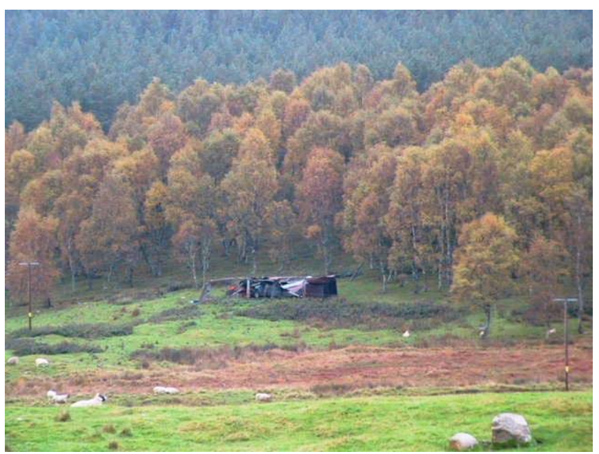
Fig. 1: Proposed site, with remains of damaged implement shed